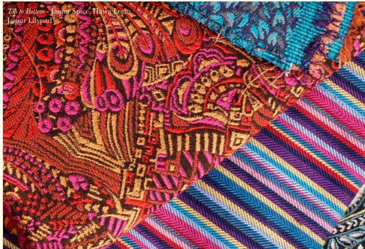
Top to Bottom - Jaipur Spice, Hawa Lotus, Jaipur Lilypad

Emporium is an eclectic collection of weaves with great emphasis on small-scale geometrics, paired with luxurious texture and ornate design.