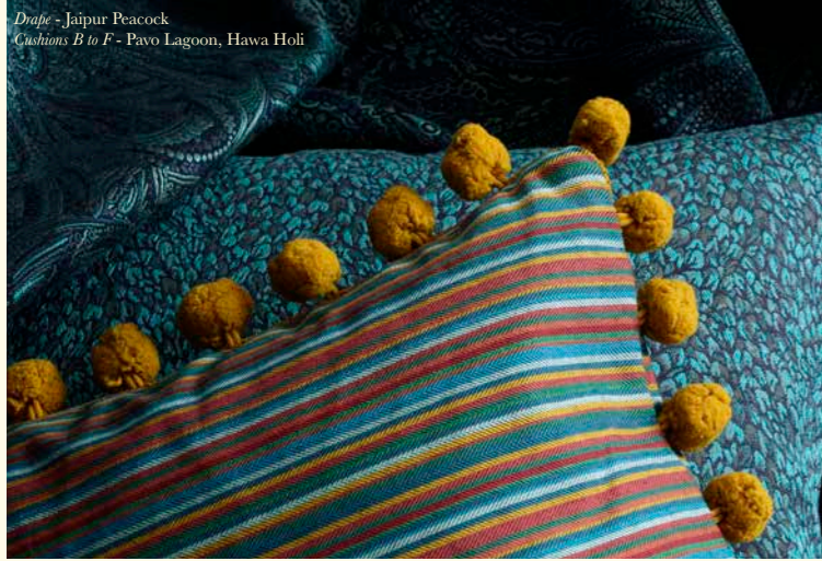
Drape - Jaipur Peacock Cushions B to F - Pavo Lagoon, Hawa Holi