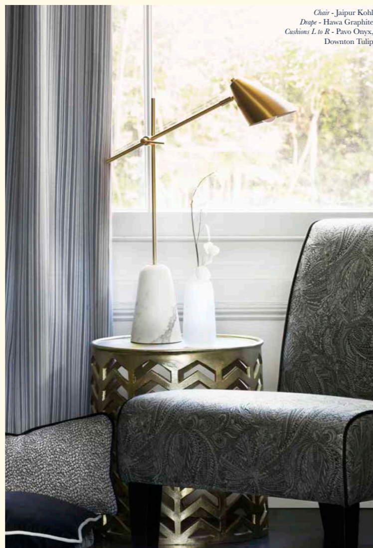
Chair - Jaipur Kohl Drape - Hawa Graphite Cushions L to R - Pavo Onyx, Downton Tulip