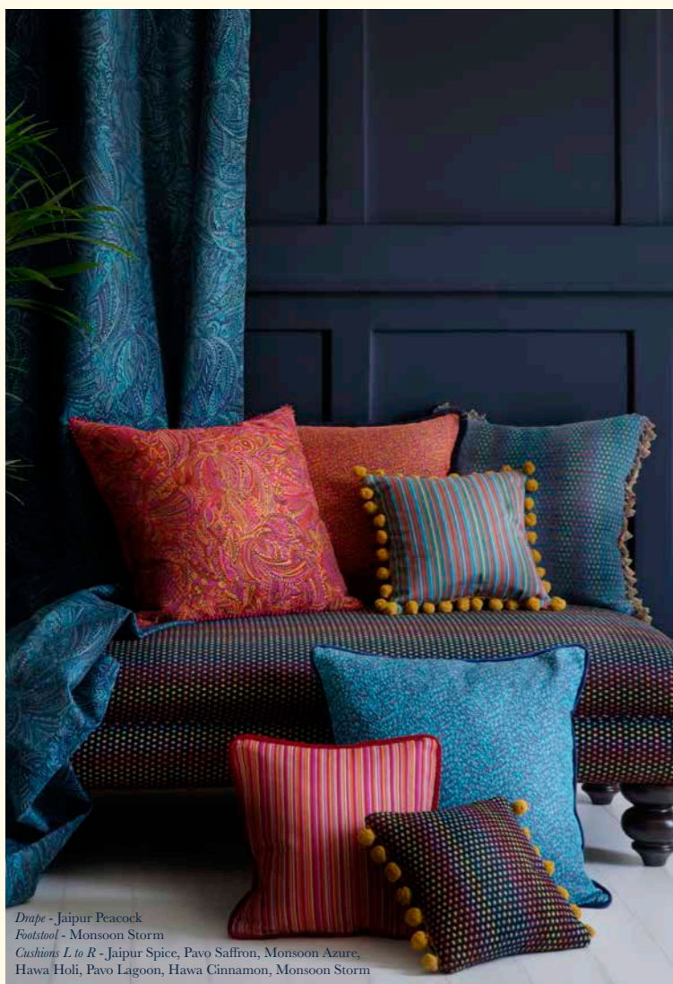
Drape - Jaipur Peacock Footstool - Monsoon Storm Cushions L to R - Jaipur Spice, Pavo Saffron, Monsoon Azure, Hawa Holi, Pavo Lagoon, Hawa Cinnamon, Monsoon Storm