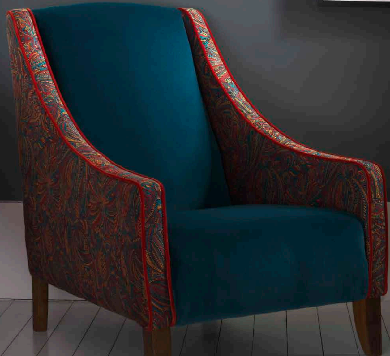
Chair - Jaipur Kingfisher Seat - Downton Pansy